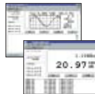
PC Capture of Graphic Display and Data Acquisition. Software Included.

Digital or Graphical displays for viewing, storage or transfer to a PC